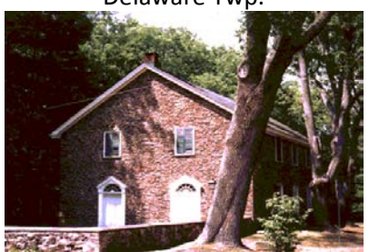
Locktown Stone Church, Delaware Twp.