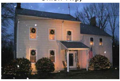
Solitude Heritage Museum (UFHA), Union Twp;