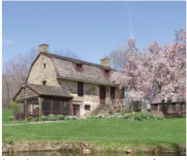
Solitude Heritage Museum (UFHA), Union Twp;