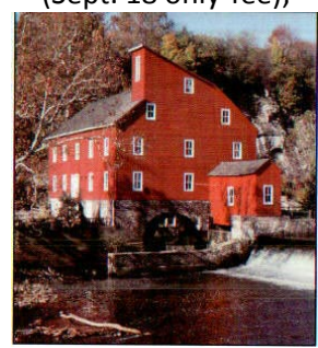
Township of Lebanon Museum, New Hampton;