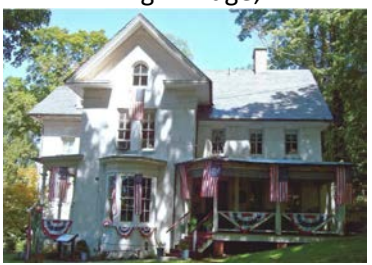
Readington Twp. Museums, Readington Twp.;